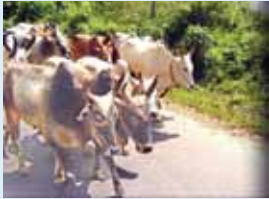
Cattle - The rural backbone of India

In the Mahatma's estimate, at least 30,000 cattle, were killed per day, to feed the British army, during its conquest. This slaughter of the cows and the economy, went on unabated every day for over 100 years. This comes to around 1,068,000,000 cows. When multiplied at a very conservative rate of Rs. 1000 per animal, the value of cattle slaughtered comes to a staggering value of Rs. 1,068,000,000,000.