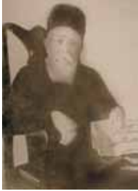
Sir. Dadabhai Naoroji

Sir. Dadabhai Naoroji (1825-1917) who studied the state of India under the British for 50 years from 1867 to 1917 says: