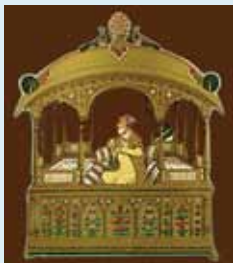
The Peacock throne