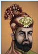
Sultan of Ghazni

The looting by Muhmud of Ghazni and Mohamad of Ghauri (1000 CE), of most of North India and the plunder of Delhi by Nadir Shah (1700 CE) caused heavy loss of wealth as well as damage to life and property. The invaders came, looted and took away all the loot back to their kingdoms.