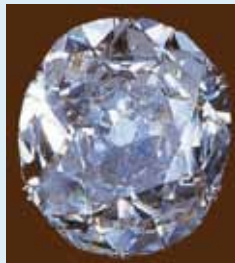
The Kohinoor Diamond