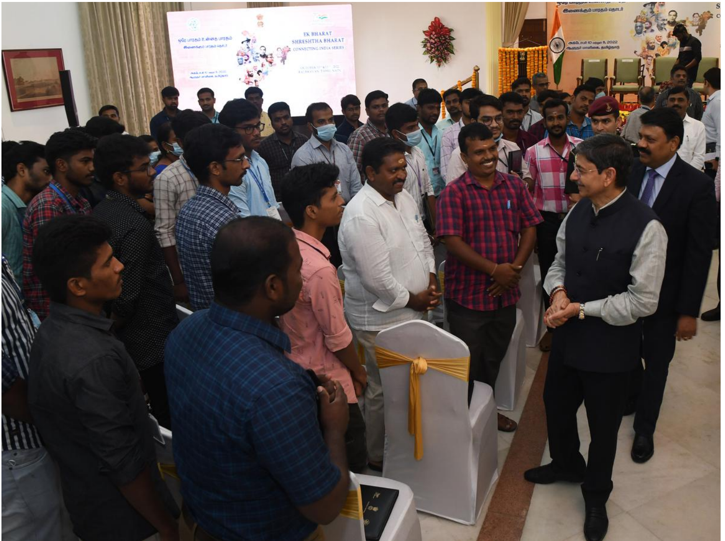
Governor R.N. Ravi interacting with participants at the inauguration of the Ek Bharat Shreshtha Bharat programme in Chennai on Monday.

Mr. Ravi said that there was a need to go back, to understand the concept of 'Bharat' which many have not been taught about. "This country cannot be fully understood with a mere understanding of India. India was never the name of this country, it was given by outsiders," he said, further speaking about Subramania Bharathiyar writing about 'Bharat' in his song as well as other freedom fighters and writers.