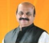
Shri Basavaraj S. Bommai Hon'ble Chief Minister