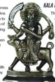
Kala Bhairava, the shetrapal, Guardian of Kashi, with his dog

With every moment that elapses, a moment of the created Universe is elapsing and the life of this created Universe is getting that much shorter.