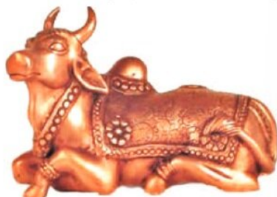
Nandi, the bull - Vahana of Shiva

While Shivaratri is the night spent in the comfort of Shiva, being