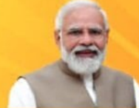
Shri Narendra Modi Hon'ble Prime Minister

The word Ratri means "comfort giver". It is derived from the root " ra, rama " meaning "that which bestows comfort, pleasantness".